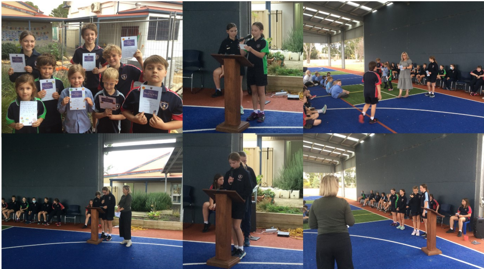
photo gallery Year 6 Assembly